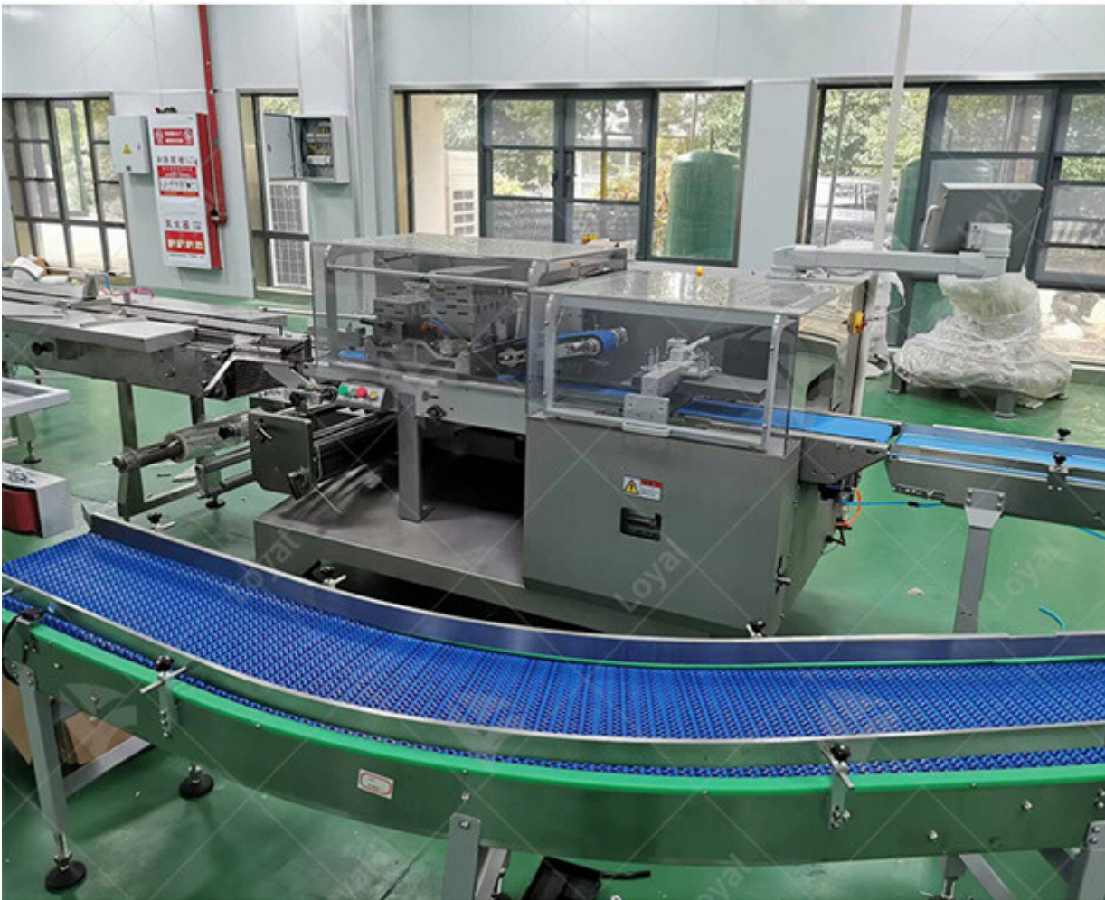
Factors to Consider Before Purchasing a Corn Puff Making Machine

Research Manufacturer Reputation: Choose a manufacturer with a proven track record of delivering reliable machinery and providing excellent customer support. Reading reviews and testimonials from other customers can provide valuable insights into the quality and performance of different models. By carefully comparing prices and features of various corn puff making machines, you can select the model that offers the best value for your money. Remember, the corn puff making machine price is just one aspect of your investment. The machine's ability to meet your production needs, enhance efficiency, and deliver high-quality products is equally important.