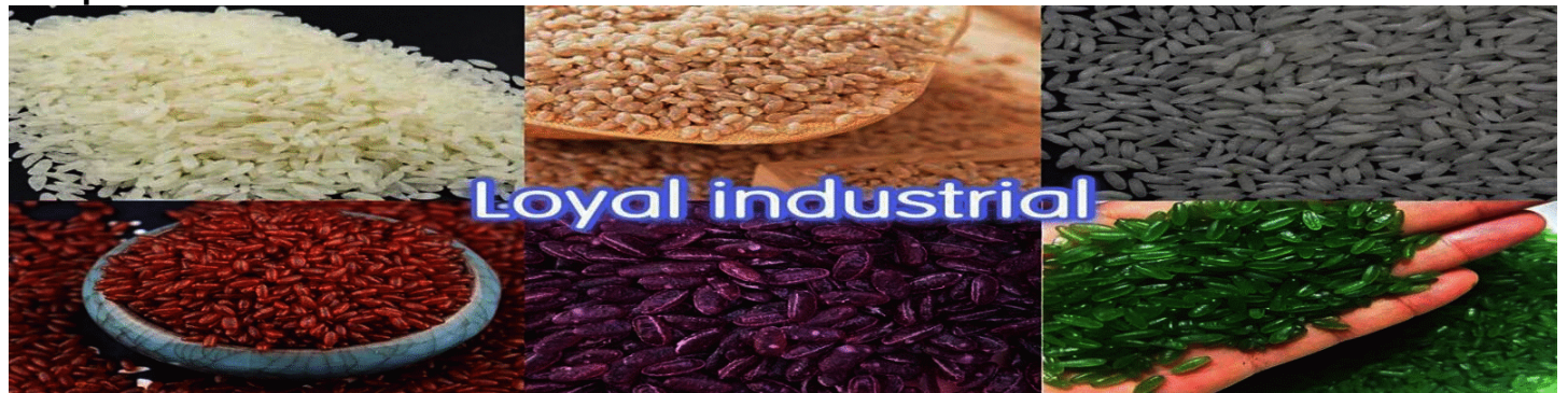
Sample Pictures of Industrial Instant Rice Making Machine Fortified Rice Processing Line