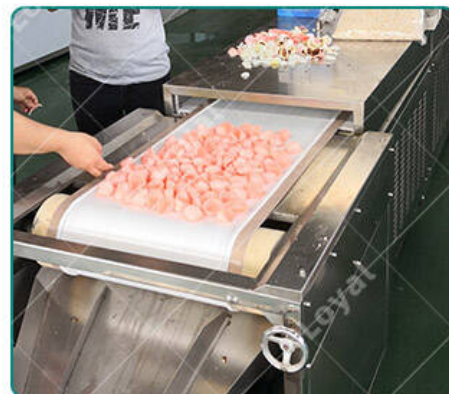
Sample Puffed Prawn Cracker Microwave Automatic Industrial Tunnel Continuous Microwave Machine