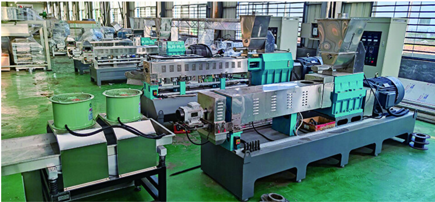
The Advantage Of Large Pet Feed Process Line