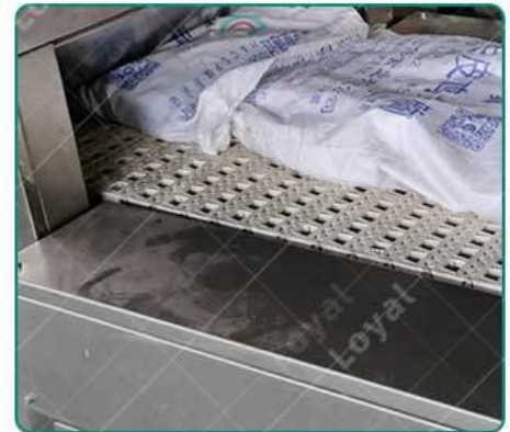
Microwave chicken thawing scene map