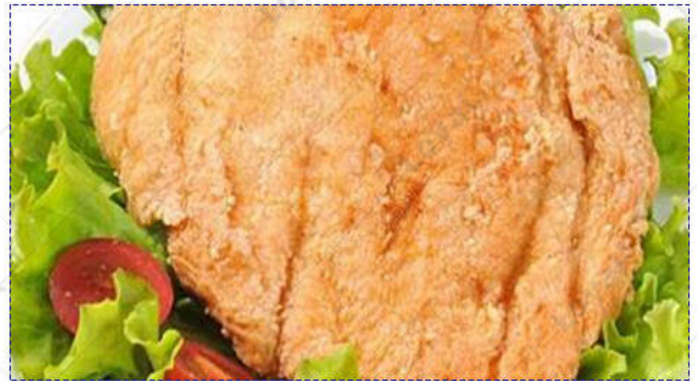
Samples Of Continuous Chicken Fillet Frying Equipment