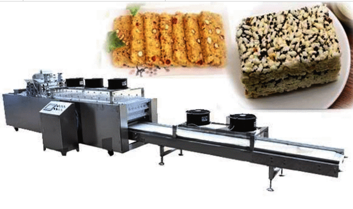
snack bar production line