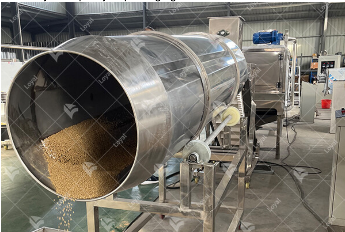
The Detail Descriptions of The fish feed production line

7. Cooling Machine: The function of the cooling machine is to cool the baked biscuits. Through forced ventilation or other cooling methods, it quickly reduces the temperature of the biscuits, dissipates the heat, and stabilizes the internal structure of the biscuits. This prevents the biscuits from becoming soft, deforming, or deteriorating due to excessive temperature during the subsequent packaging process, and it also helps improve the efficiency and quality of packaging.