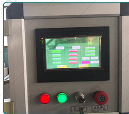
Detail of Tenebrio Mealworm Insect Microwave Drying Sterilization Machine