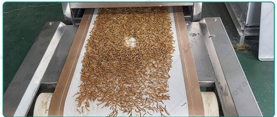
Test of Tenebrio Mealworm Insect Microwave Drying Sterilization Machine in Customer's Workshop Tenebrio Mealworm Insect Microwave Drying Sterilization Machine Video