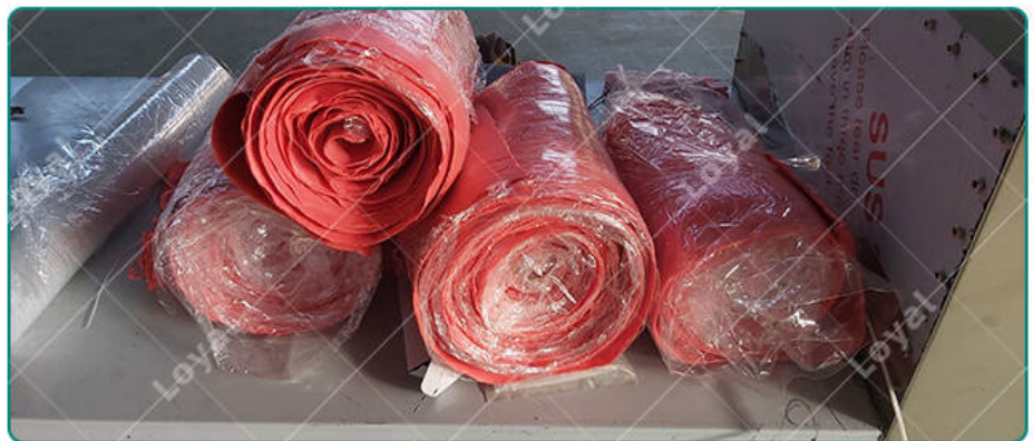
Testing of Continuous Microwave Rubber Mattress Drying Machine in factory