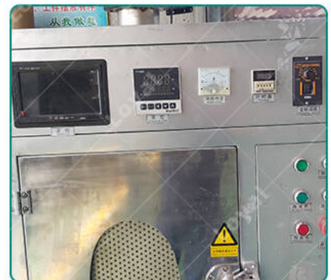
Continuous Microwave Rubber Mattress Drying Machine in factory