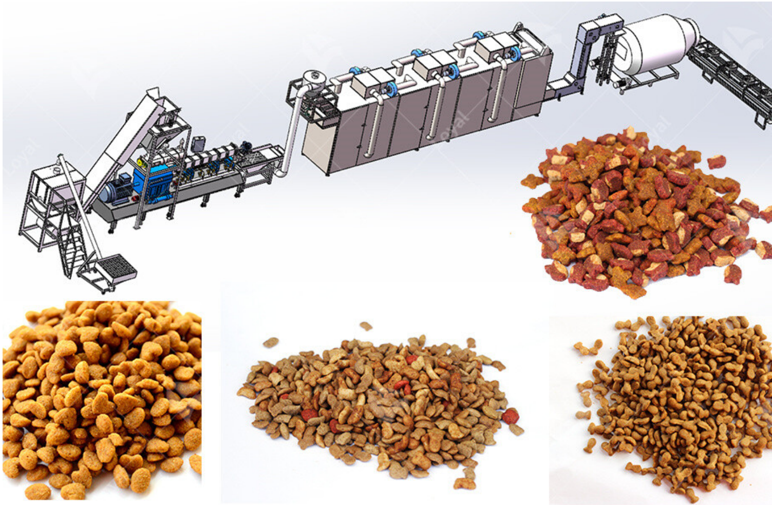
The Parameter Of Large Pet Feed Process Line