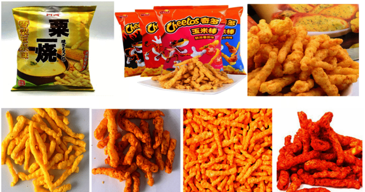
Kurkure Snacks Samples