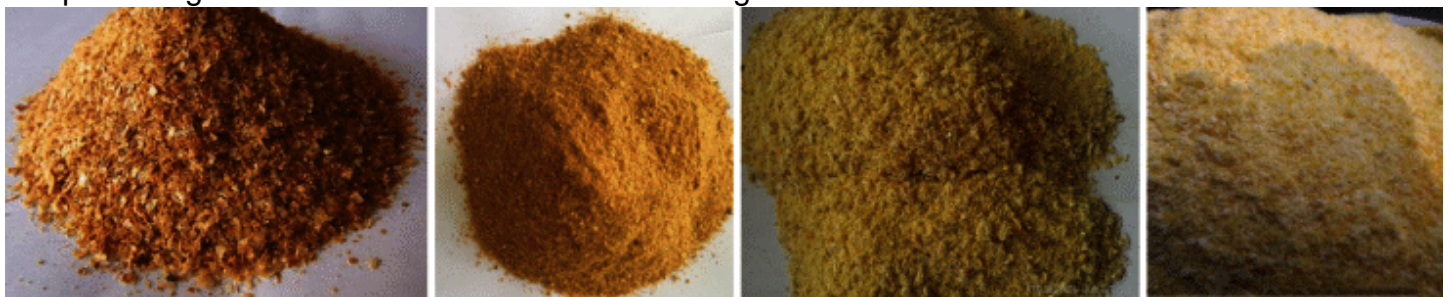
Snack Baked Kurkure Raw materials

Adopts corn grits as raw materials meanwhile mixing with water and oil.