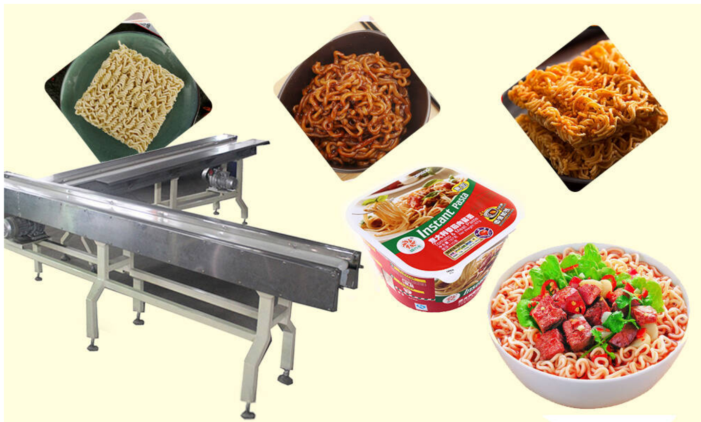
Non-Fried Instant Noodles Production Line