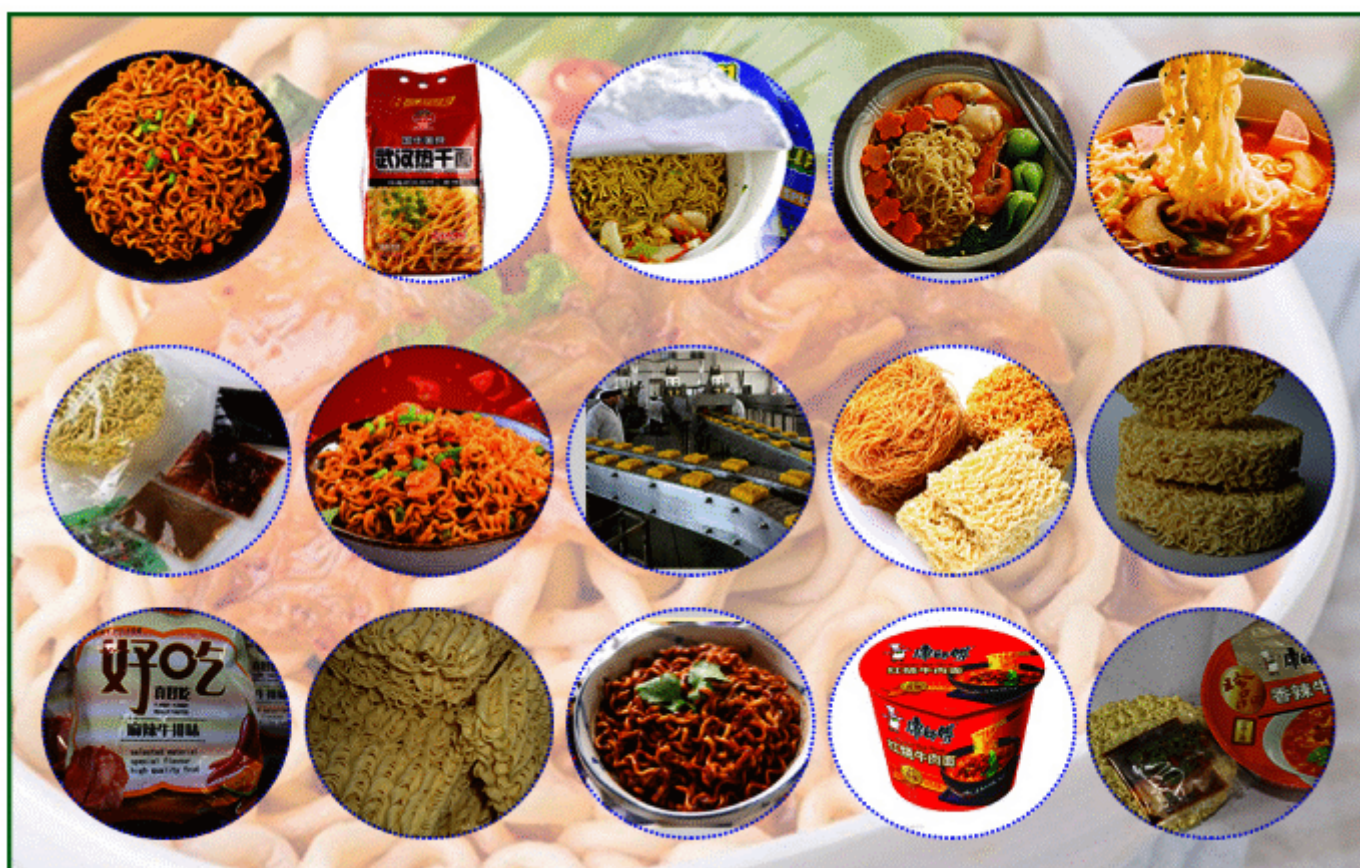
The sample of instant noodles line