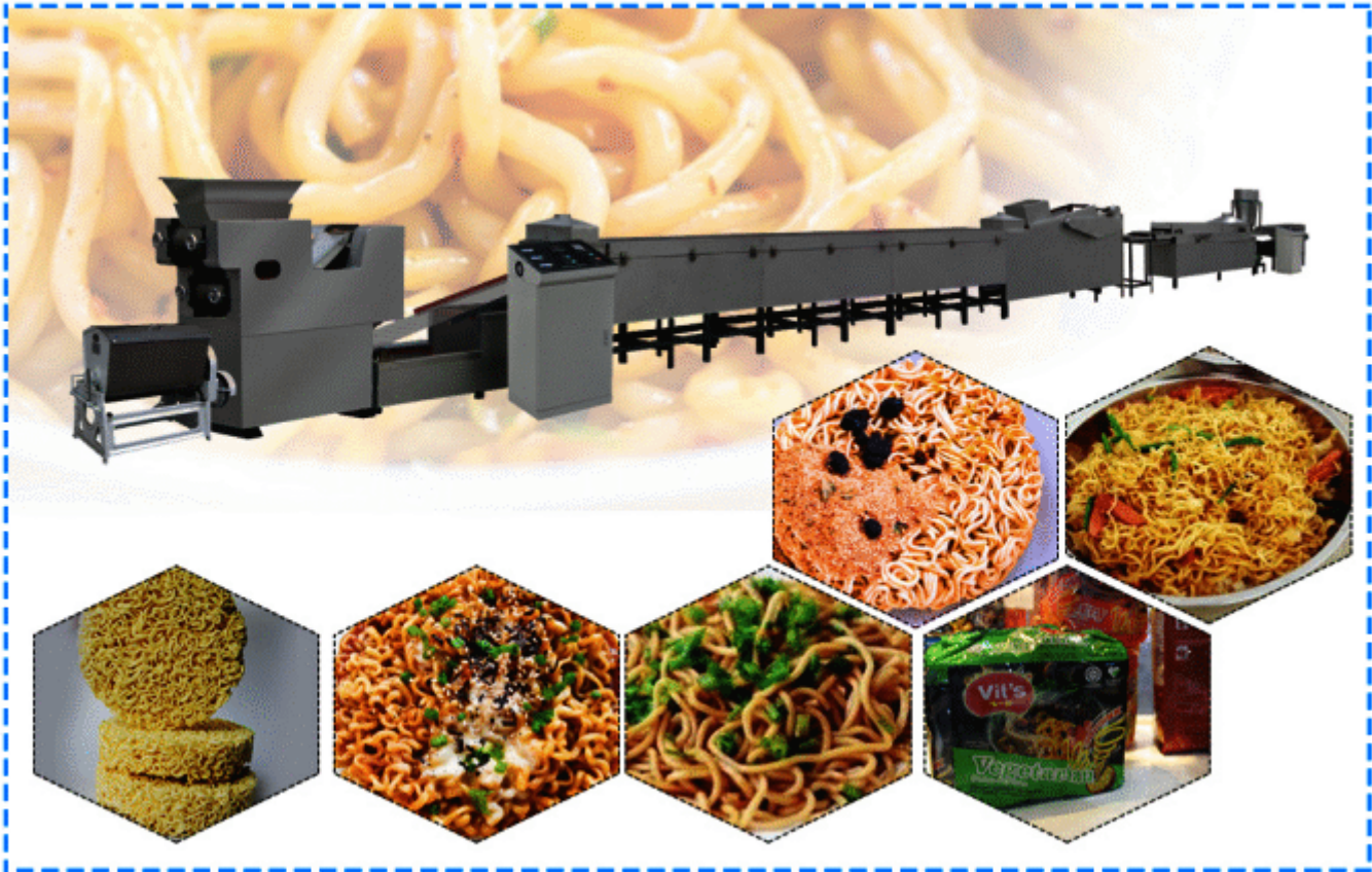
Instant noodles processing line