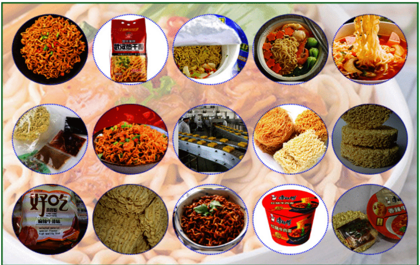
The sample of instant noodles line