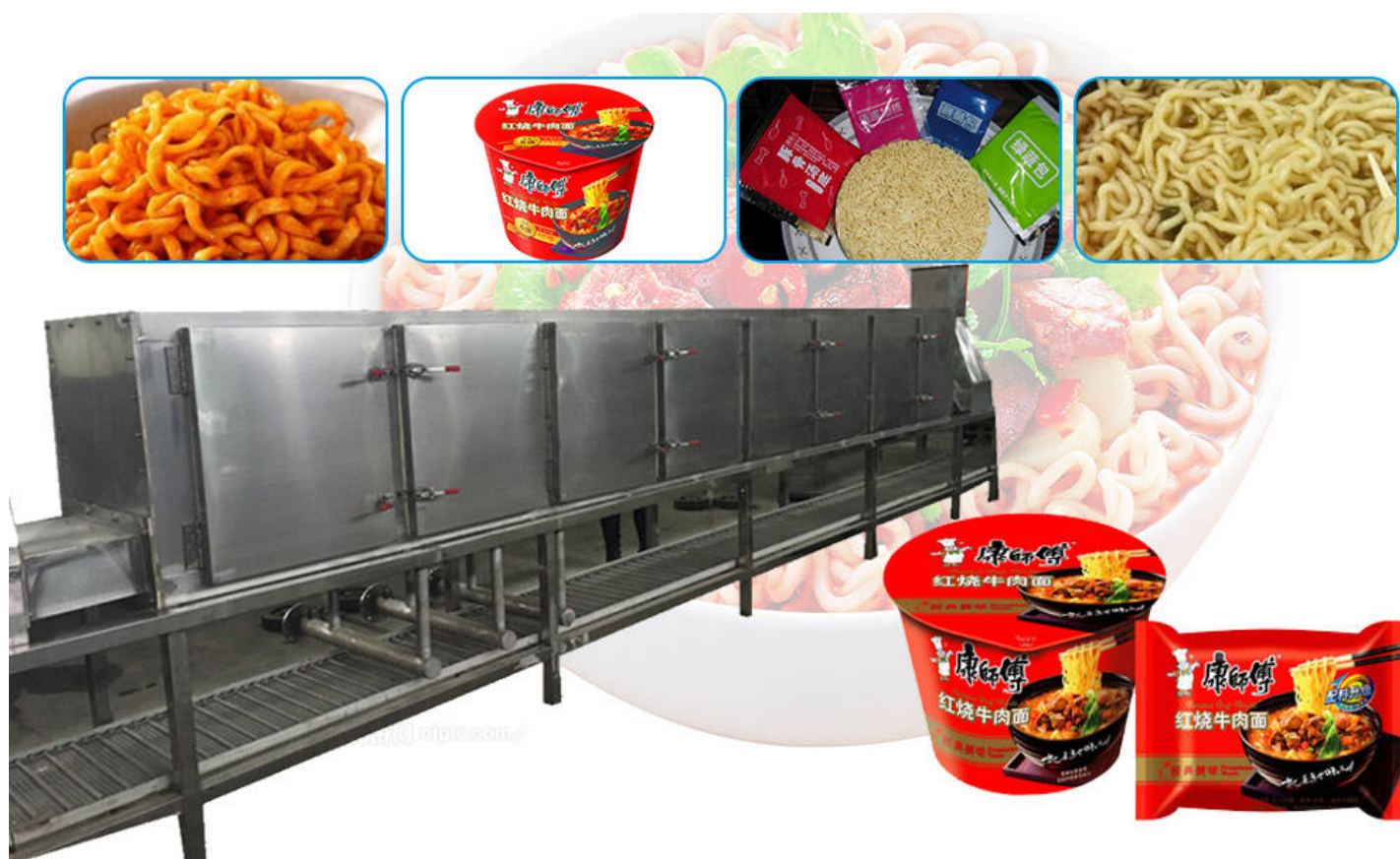
Instant Noodles Production Line