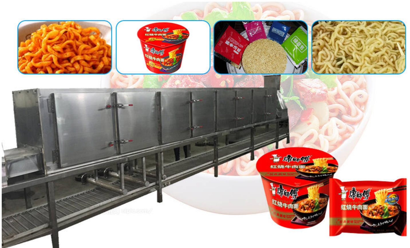
Instant Noodles Production Line