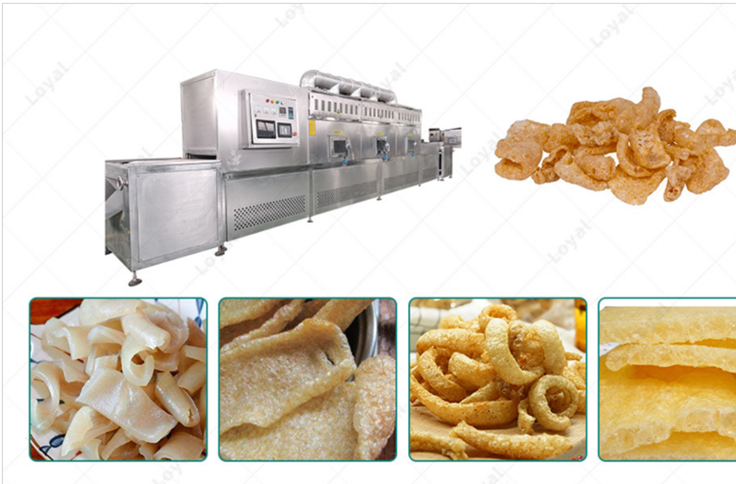
Parameter Of Microwave Pork Skin Puffing Machine: