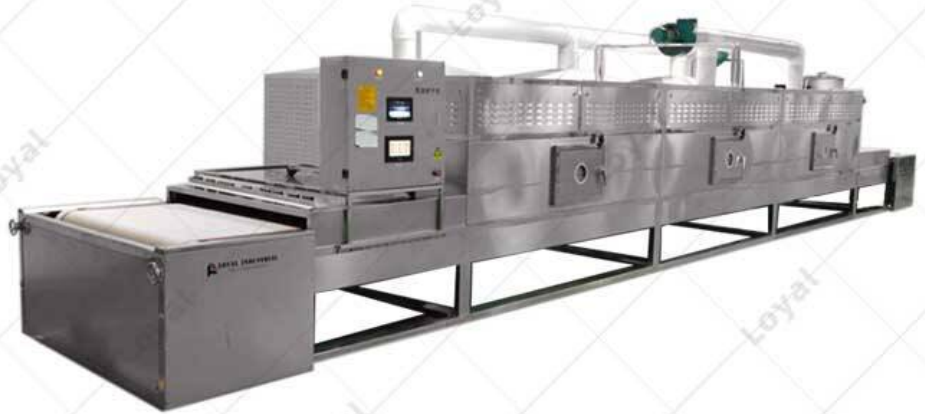
CAD Of Microwave Thawing and Sterilization Machine for Seafood