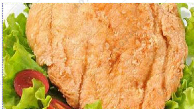
Samples Of Continuous Chicken Fillet Frying Equipment