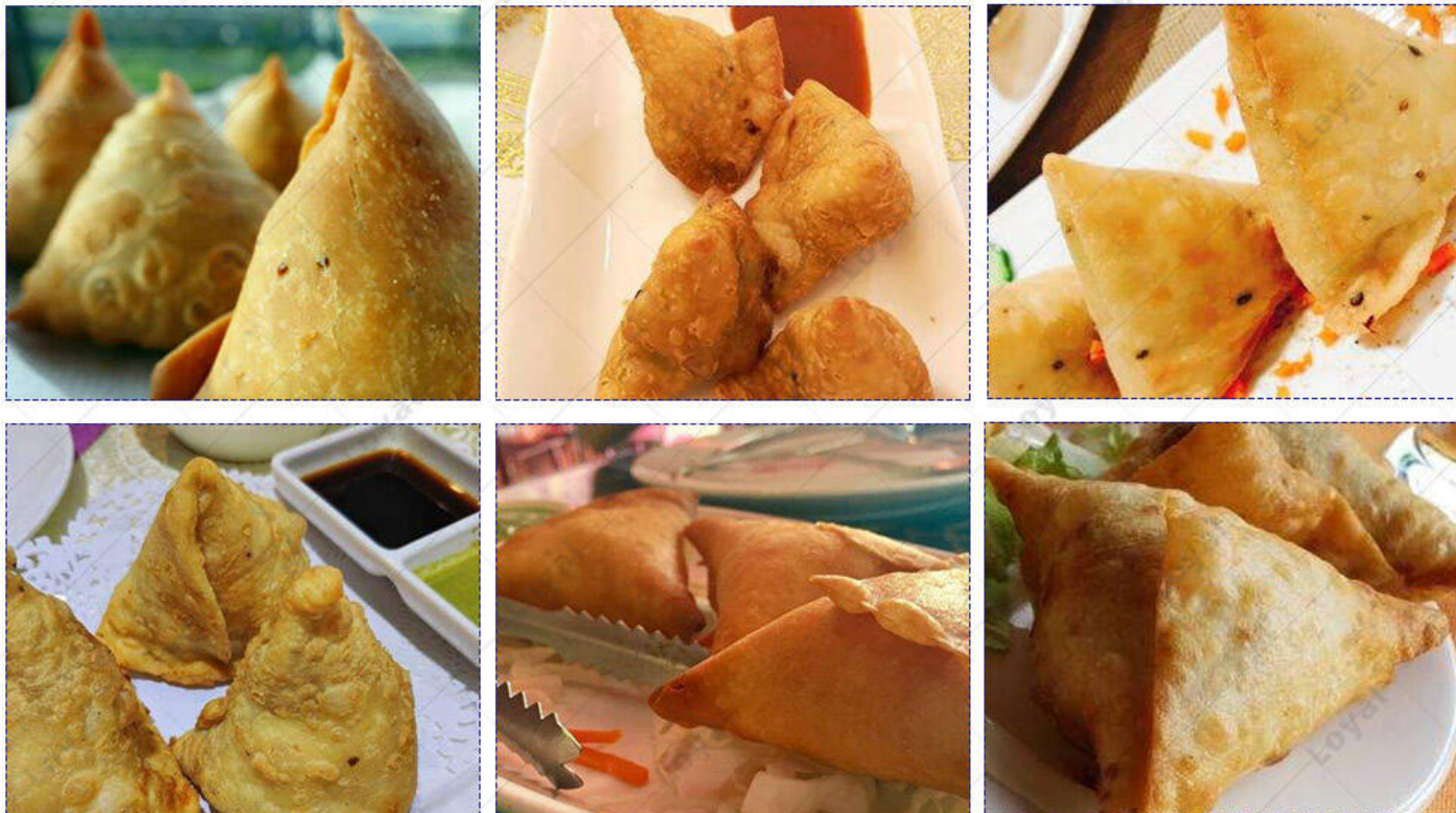
Continuous Fryer Samosa Processing Sample