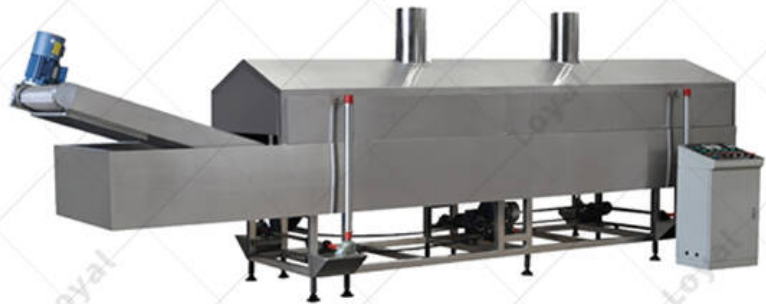
Flow Chart Of Automatic Potato Chips Continuous Frying Processing Line

Raw Material Handling System: This section is responsible for preparing raw materials, such as washing, cutting, and soaking, to get them ready for frying.