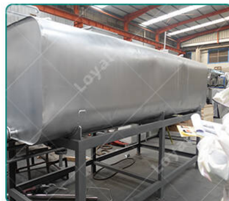
Feature Of Continuous Stainless Steel Potato Chips Fryer Manufacturing Equipment