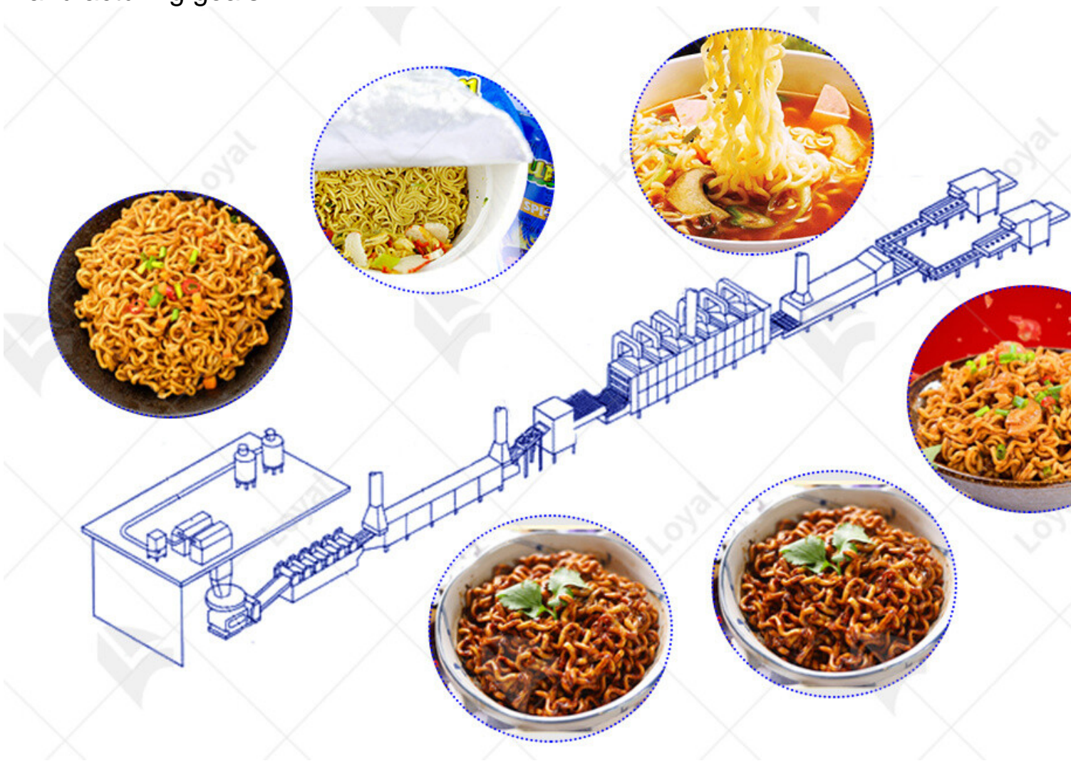
Instant noodle production line flow chart

Understanding these basic elements is the first step in choosing the right setup for your manufacturing goals.