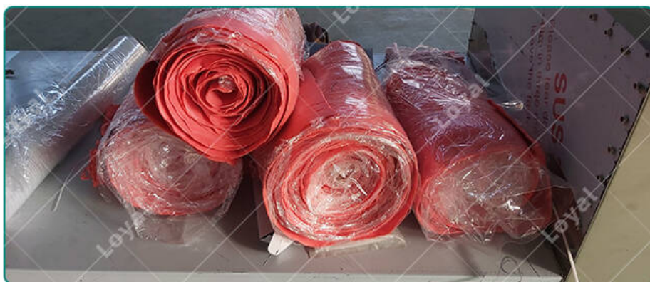
Testing of Continuous Microwave Rubber Mattress Drying Machine in factory