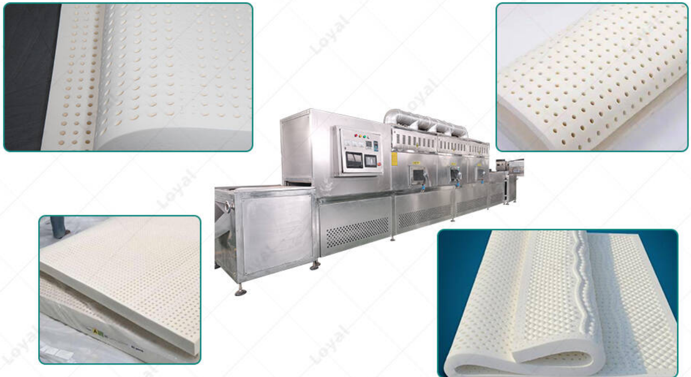
Sample of Continuous Microwave Rubber Mattress Drying Machine

The core of rubber microwave drying equipment is a microwave generator. At present, the frequency of latex microwave drying is mainly 2450 MHz. Continuous rubber microwave oven is mostly used in the drying of chemical, food, agricultural and sideline products, wood, building materials, paper products and other industries. It can also be used for food, agricultural and sideline products, etc. sterilization.