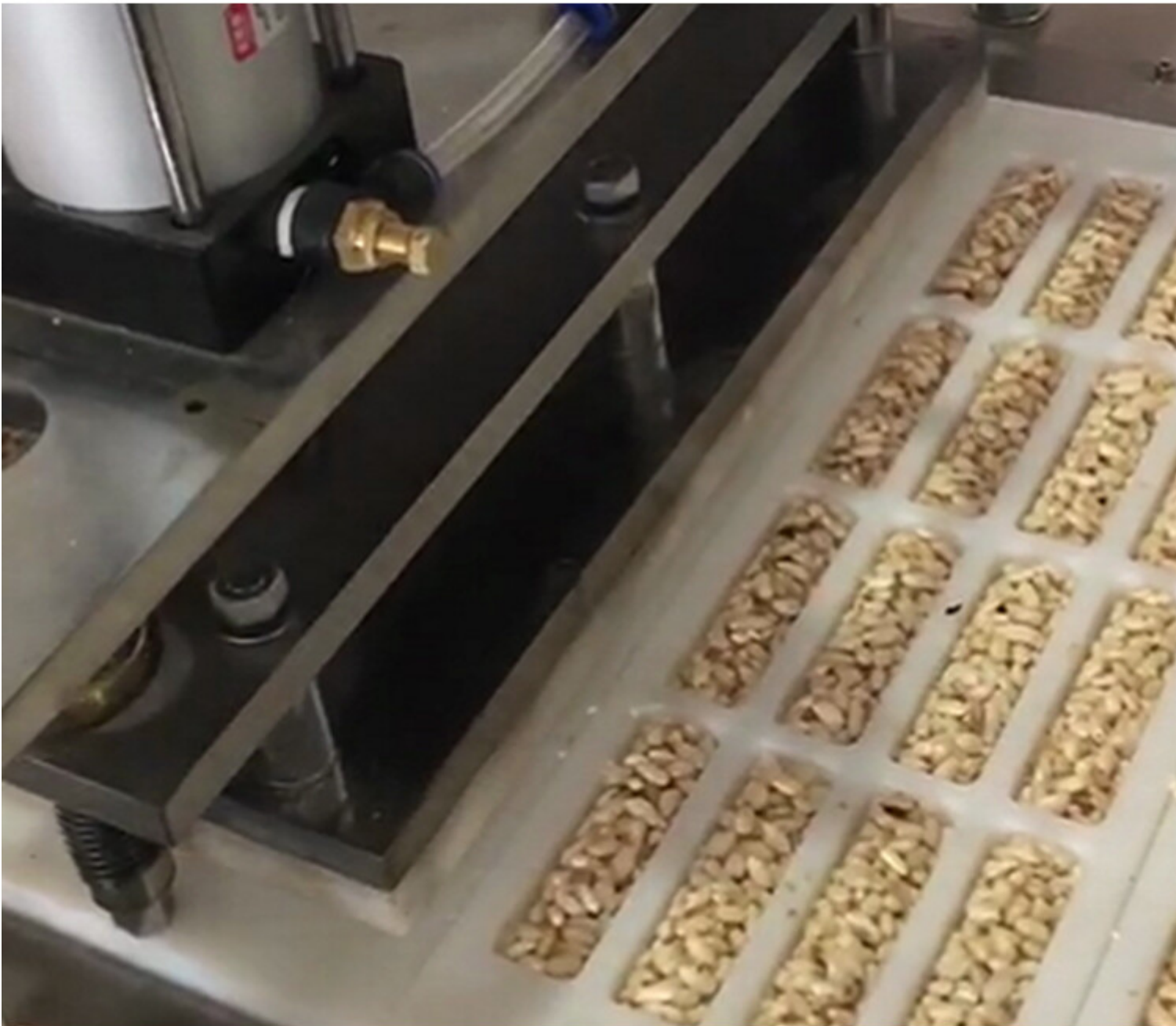
Advantages of a Fully Automatic Nutrition Bar Making Machine

endurance enthusiasts, emphasizing protein content, vitamins, and minerals. Entering the 2000s, the market expanded even further to include meal replacement and weight management solutions, and health-conscious snacks tailored to everyday consumers. The focus shifted toward cleaner labels, plant-based ingredients, and specialized dietary needs such as gluten-free or keto-friendly options. Today, nutrition bars are a mainstream product found in convenience stores, supermarkets, and health food outlets worldwide, supported by advanced manufacturing processes and diverse formulations that continue to evolve with consumer demand.