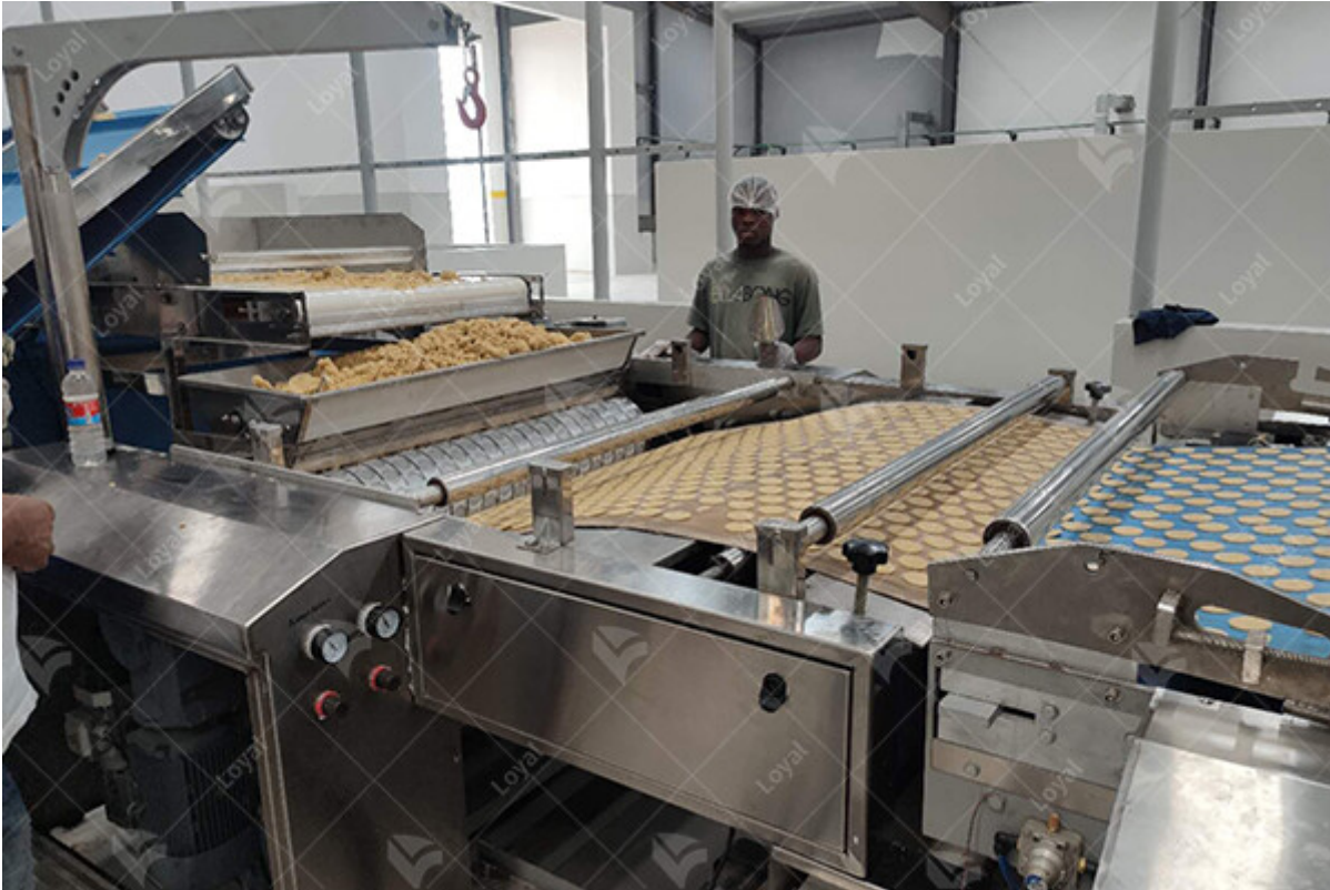
Biscuit production line flow chart

the mixers and shapers to the baking ovens and cooling conveyors—is designed for high throughput, stable performance, and compliance with food-grade manufacturing standards. Moreover, integrating automation doesn't just mean speed—it also enhances precision, allowing producers to experiment with diverse recipes, textures, and cookie shapes without sacrificing output. Whether it's traditional butter biscuits or complex filled cookies, a modern biscuit production line ensures optimal performance under varying production conditions.