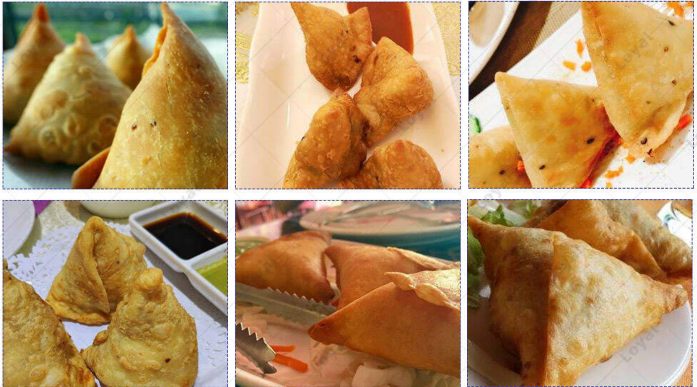
Continuous Fryer Samosa Processing Sample