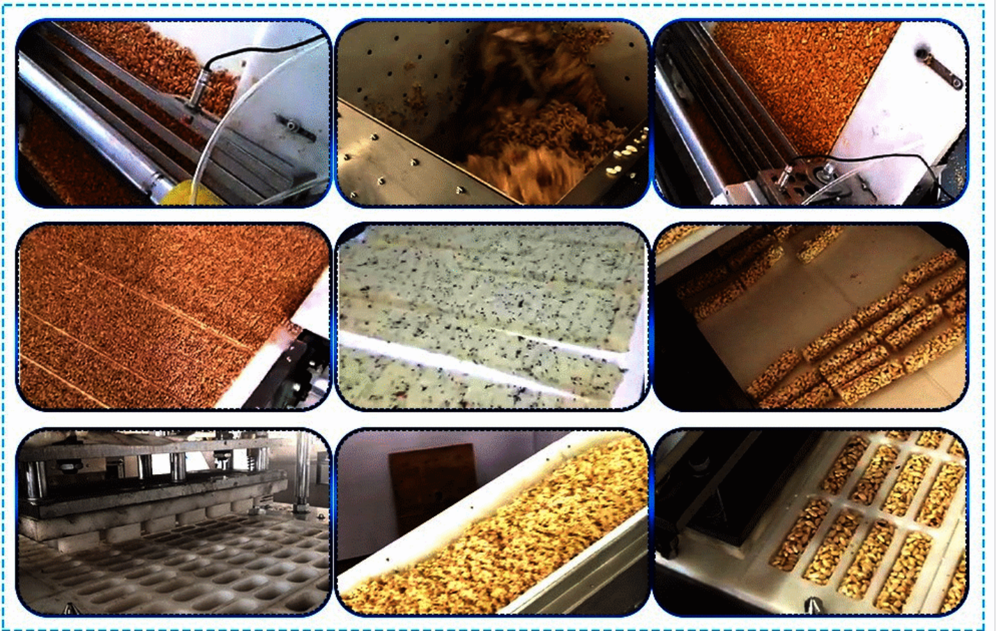
Display of finished products