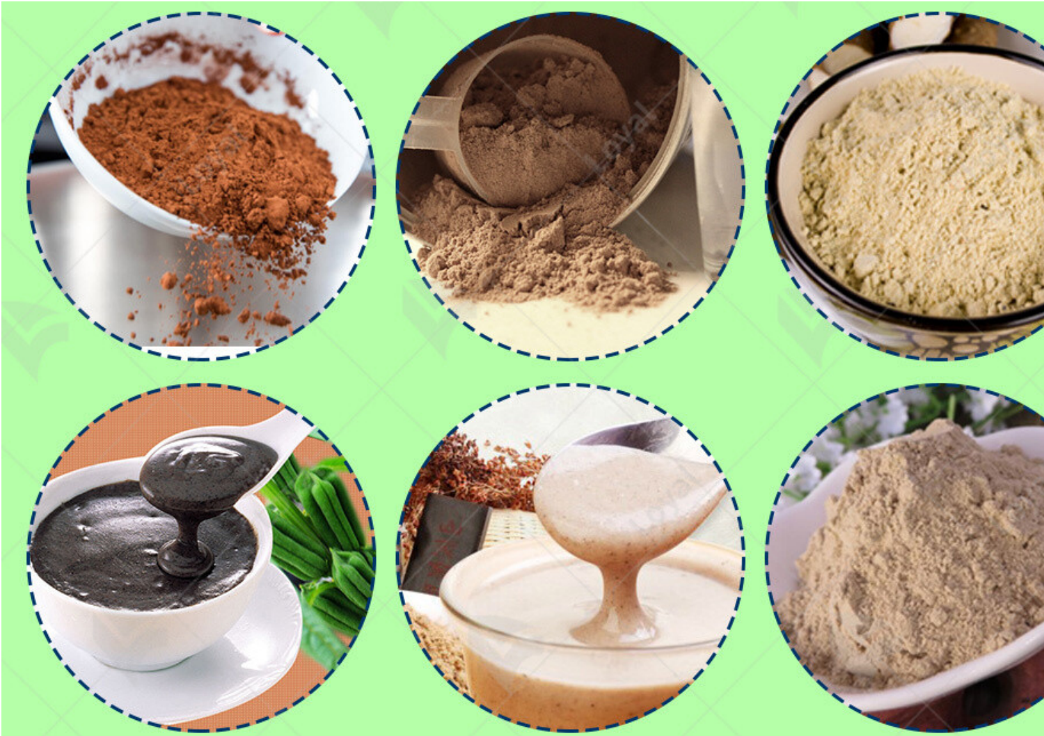
Nutrition power production line flow chart

From raw materials to finished products, how is the nutritional powder production line produced? What equipment does it require? How does it work? Please continue follow this article.